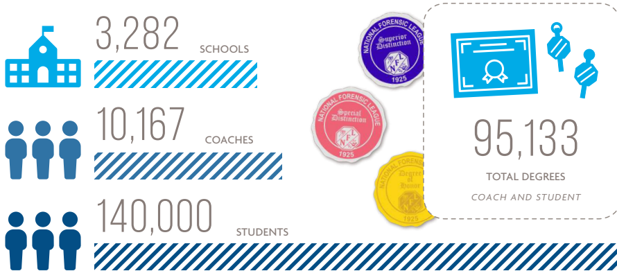
FIG. 3 – HONOR SOCIETY PARTICIPATION

Each event in speech and debate features a different form of public speaking and requires a unique skill set. NSDA membership provides an extensive array of exclusive benefits to support coaches and students as they explore each event and hone their skills, including tournament opportunities, research guides, textbooks, lesson plans, practice drills, performance videos, webinars, professional development for coaches, scholarship opportunities for students, and more.