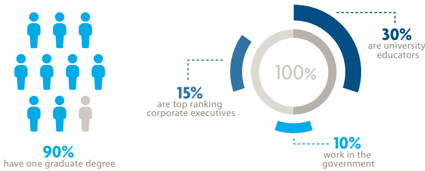
FIG. 2 – DEBATERS AND LIFE AFTER GRADUATION